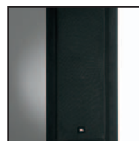
Left, center and right channel speakers integrated into frame.