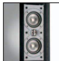
Standard JBL 5.1 Surround Sound System, upgradeable to 6.1 or 7.1.