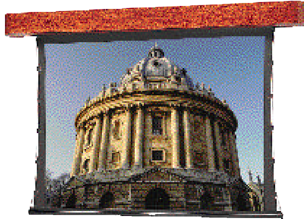
All fabrics will be seamless.